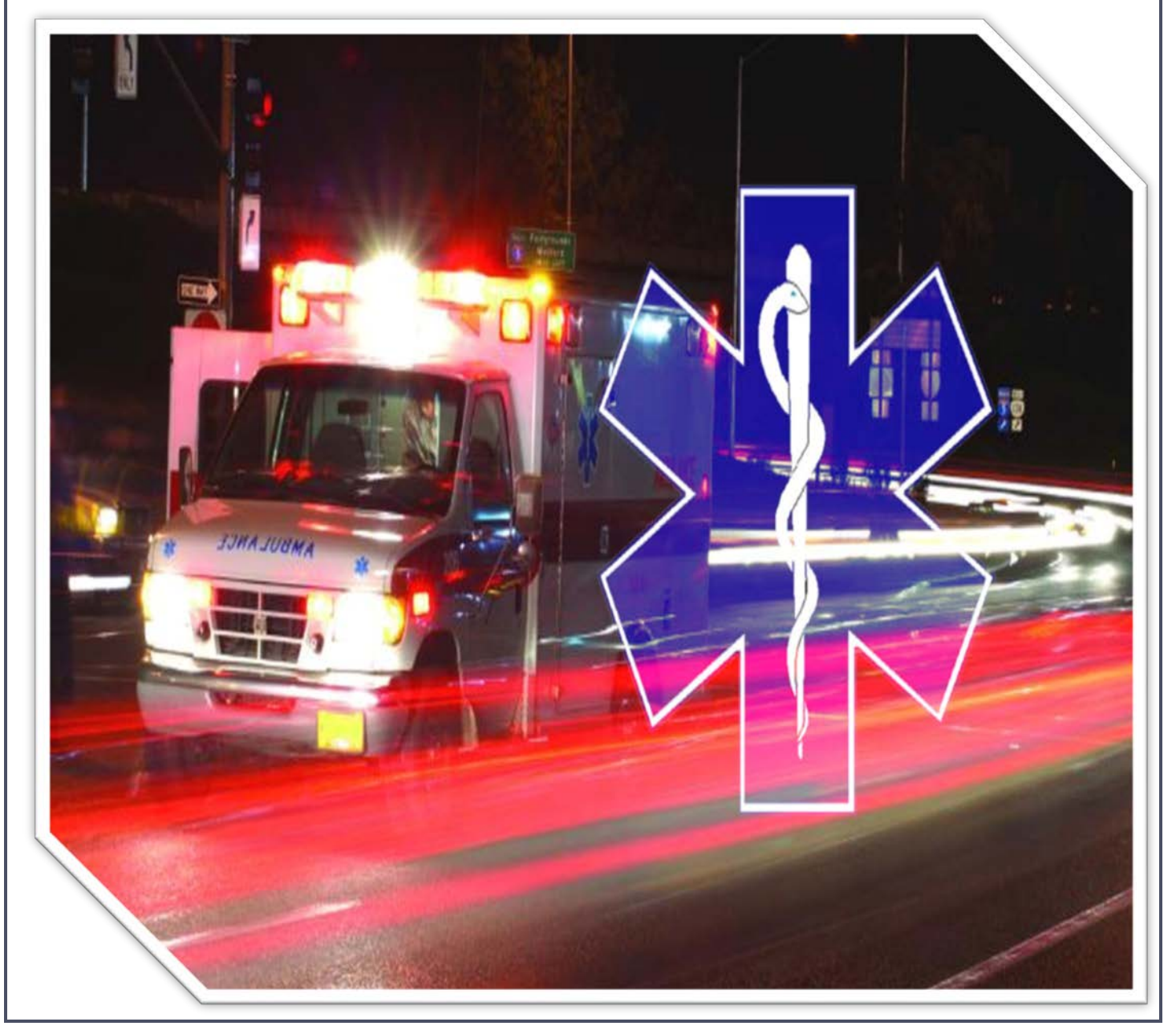
West Virginia Office of Emergency Medical Services Certification Policies 2019